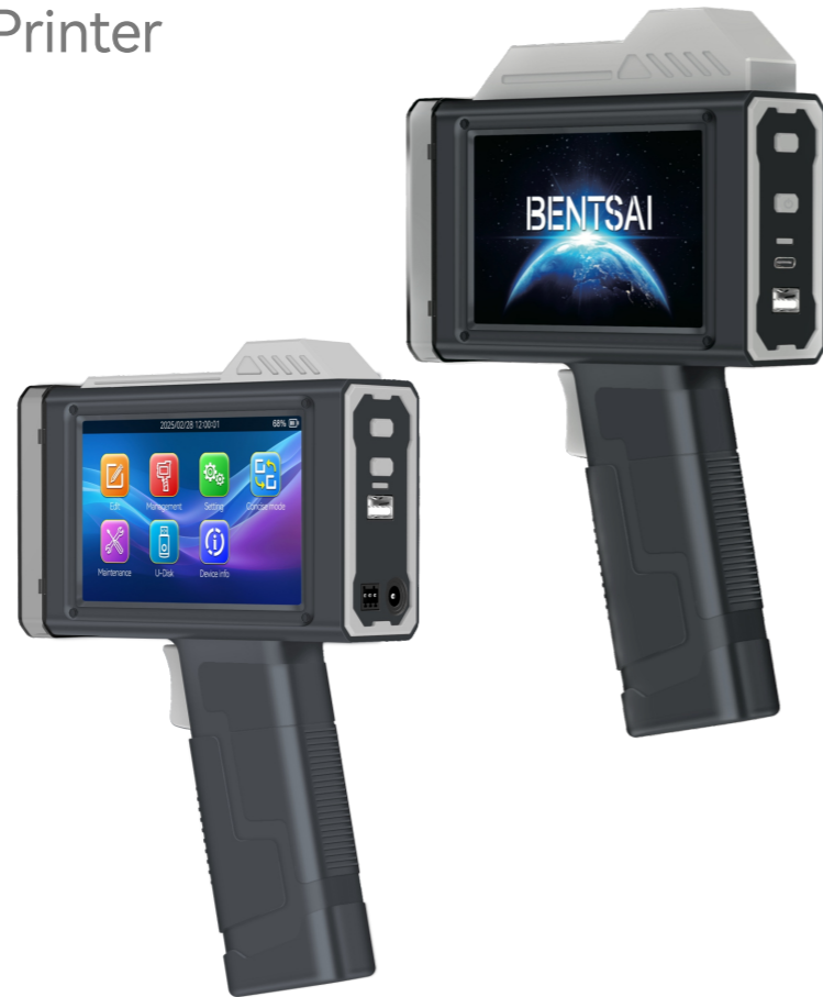
HH6205 B · HH6205 BL